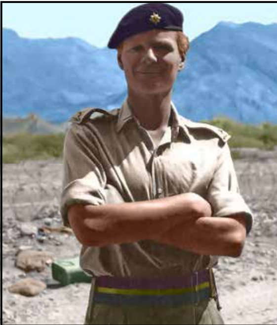
The Author at Habilayn

I went to South Arabia with the 4th/7th Royal Dragoon Guards as part of the regiments deployment on a