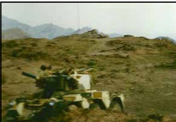
Saladin up country

twelve month unaccompanied Middle East tour. Throughout my time there I commanded a troop of Saladin and Mk II Ferret armoured cars, and was extremely fortunate that the soldiers who served with me were remarkably tolerant of my many inadequacies as a troop leader. It was suggested to me that I should write about this tour because of making two subsequent visits to South Arabia (now the Yemen).